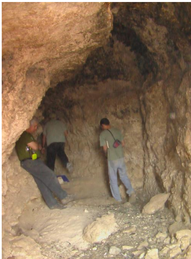
Fig. 5 The larger chamber of Christmas Cave.