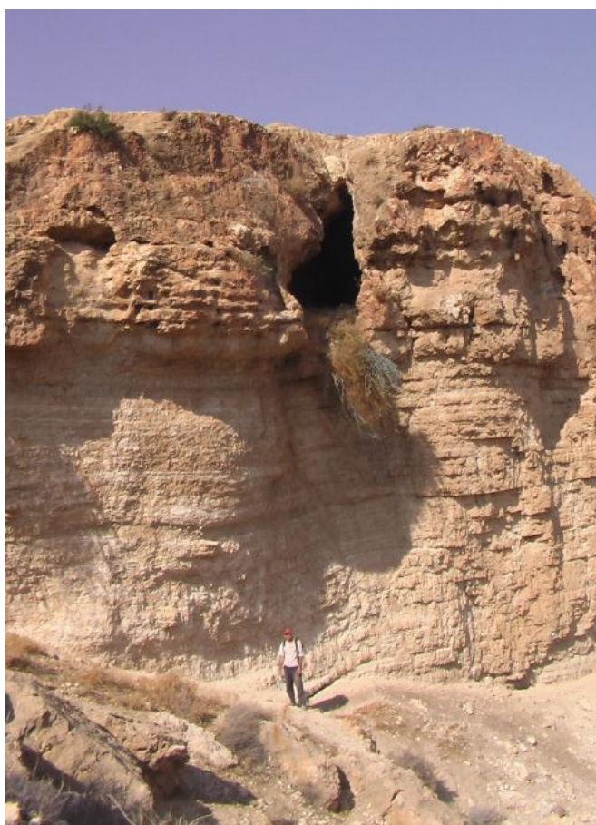
Fig. 4. Southern entrance of Christmas Cave.