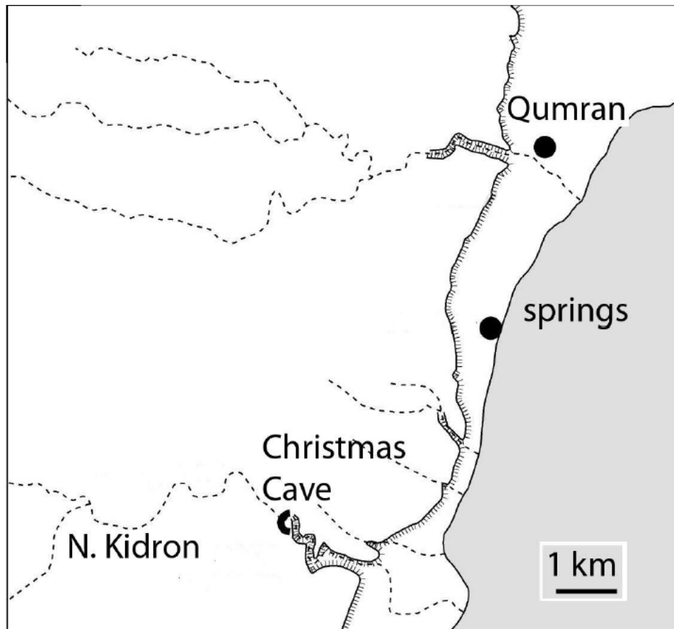
Fig. 1. Location map of Christmas Cave, at the Nahal Kidron canyon, SSW of Qumran.