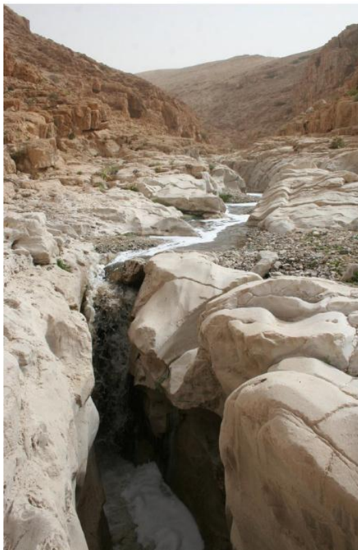
Fig.7. The ephemeral stream of Nahal Kidron below Christmas Cave.

For the return to the List of Contents, click: