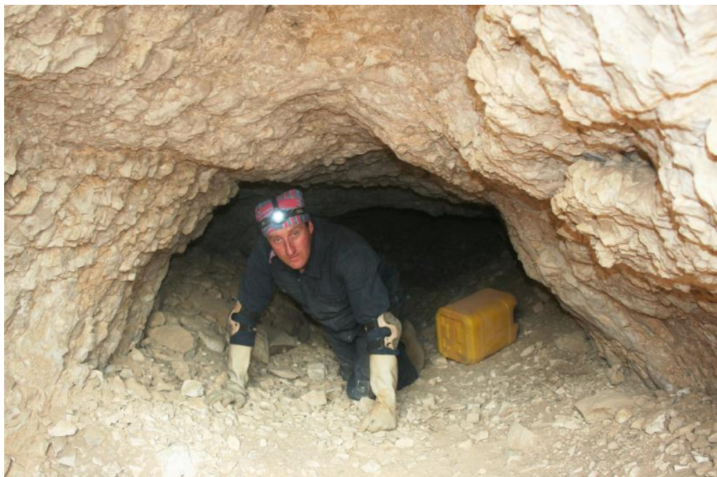
Fig. 6. Northern entrance of Christmas Cave.